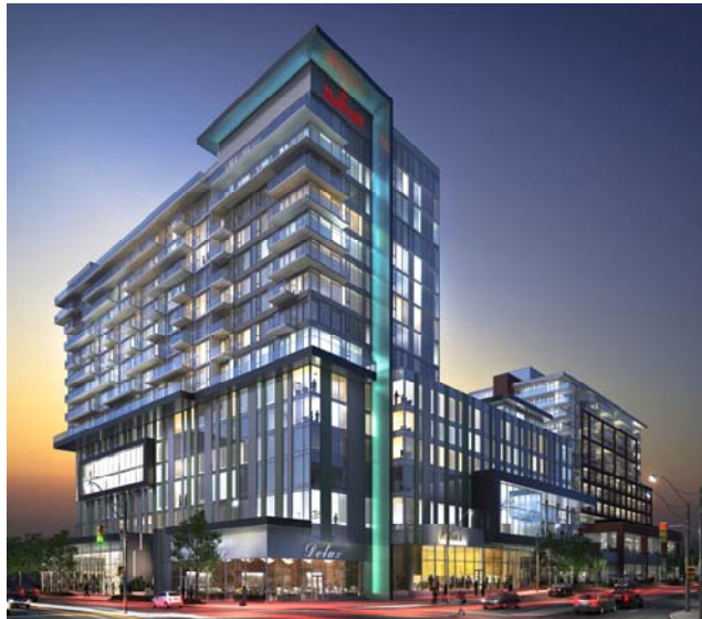
The new Marriott Hotel and Condominium Residence building to be built on the NE corner of Enterprise and Birchmount Road.

If you know of a location that needs a bus shelter, let me know and I will try to have one located there.