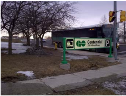
New bus shelter coming to Bullock Drive and GO Stn Lane