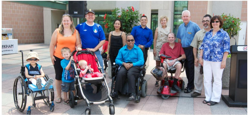
Working with people with challenges.