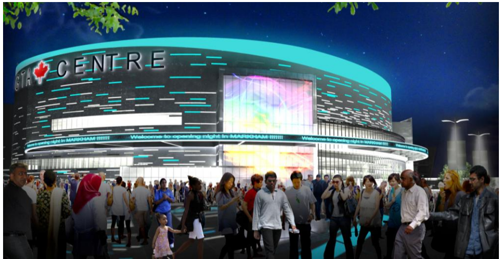
Artist rendering of the new proposed Sports, Entertainment and Cultural Centre

The City half of the debt will be paid for through a voluntary development levy on every new home, condominium and townhome in Markham. Other sources of debt repayment funding are: section-37, tax