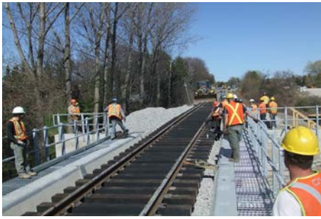
New Unionville GO train bridge completed