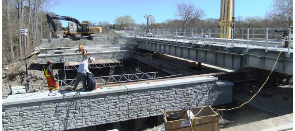
Sliding the new GO train bridge (between Main Street & Kennedy Road) into place.

It will start at 16th Avenue, follow the Toogood Pond pathway to Carlton Road and Main Street, go behind Main Street lane on the existing pathway system then