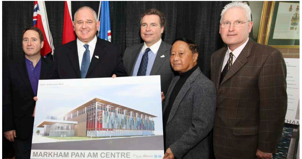
The Pan Am Aquatic and Badminton Centre in Ward 3 Unionville

Staff will monitor the effectiveness of these activities and identify further improvement measures going forward.